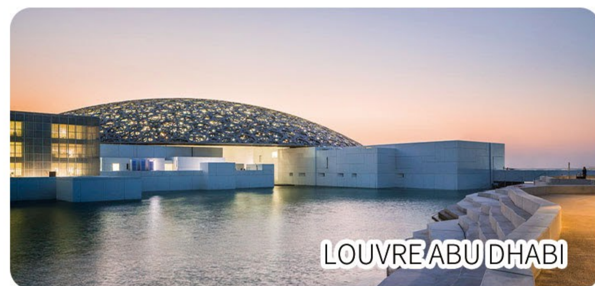
LOUVRE ABU DHABI

Hotel: DoubleTree by Hilton Dubai M Square Hotel & Residences or similar