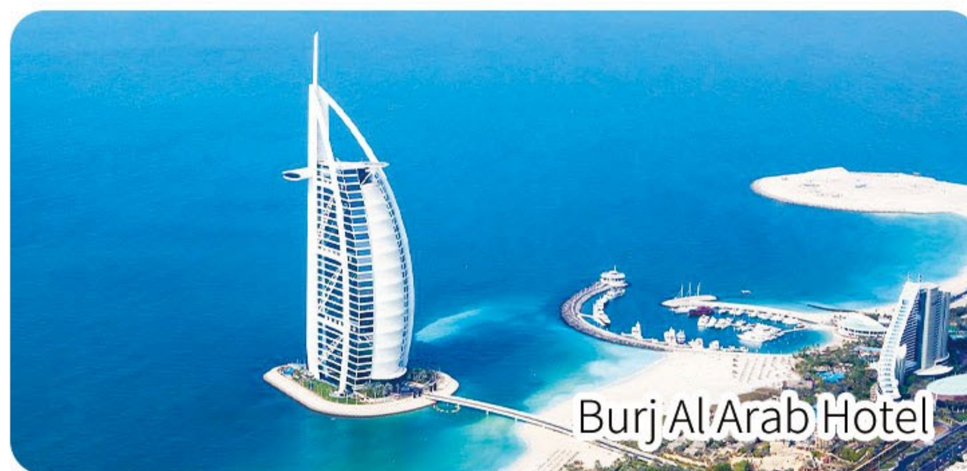
Burj Al Arab Hotel

Hotel: DoubleTree by Hilton Dubai M Square Hotel & Residences or similar