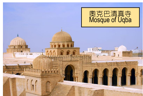
奧克巴清真寺 Mosque of Uqba

(早、午、晚餐) Proceed to "Mosque of Uqba", built in 670AD with 100 pillars brought over from the ruins of Carthage. (Note: Photo-taking is allowed only outside the Mosque when religious ceremonies are in progress). Later on, coach to visit Sbeitla the famous ancient town. It became rich by producing olive products. Then onto Tozeur, the most modern oasis town in Sahara region, popularly known as "Date Palm Capitol". (B/L/D)