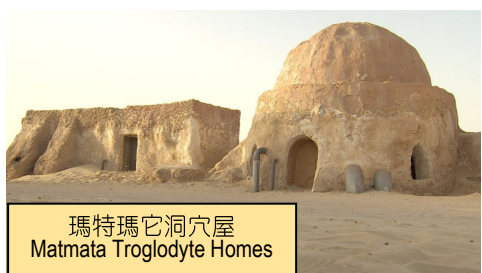
瑪特瑪它洞穴屋 Matmata Troglodyte Homes

(早、午、晚餐) The tour begins the day by crossing the country's largest "Salt Lake" spanning a total area of 5,000 square kilometers. Later on, proceed to Douz, renowned as "Gateway of the Sahara". The next place of visit is the Matmata, the settlement of the "Berber" where the inhabitants live in rock-hewn dwellings. The movie "Star Wars" was specially shot here. Arrangements for home-visits of the Berber will be made. Finally, coach to Sfax/Mahdia for overnight. (B/L/D)