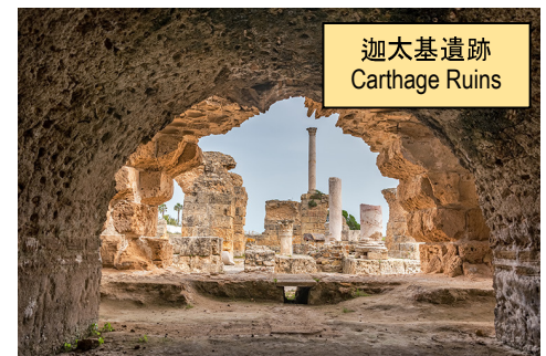
迦太基遺跡 Carthage Ruins

Proceed to Sidi Bou Said, a seaside resort and as well, a charming hilltop village overlooking the Mediterranean Sea for its beautifully decorated blue and white architecture. The next attraction is "Carthage Ruins". Carthage was built in the 9th century BC, and was once a military stronghold under the sovereign of Phoenicians and Romans. (B/L/D)