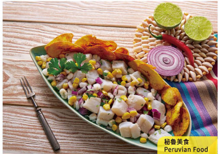
秘魯美食 Peruvian Food

是日搭客機飛往秘魯首都利瑪，抵達後前往酒店休息。 住宿：Casa Andina Select Miraflores Hotel或同級 Upon arrival in Lima, capital city of Peru, transfer directly to the hotel for leisure or rest.