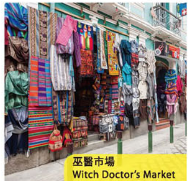
巫醫市場 Witch Doctor's Market