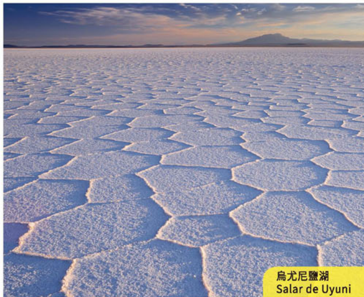
烏尤尼鹽湖 Salar de Uyuni