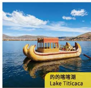
的的喀喀湖 Lake Titicaca