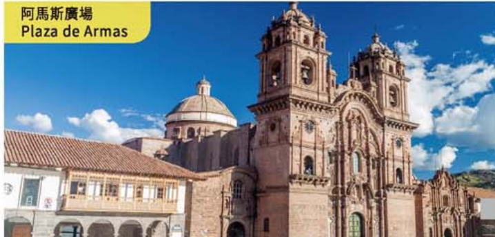
阿馬斯廣場 Plaza de Armas

This morning we set out for a guided tour of the ancient capital of the Inca Empire—Cusco, the oldest continuously inhabited city in the Western Hemisphere. The tour visits important landmarks such as Cusco's Cathedral, Plaza de Armas and Koricancha, "The Temple of the Sun". Take in a delightful combination of Inca and colonial architecture. We will also visit Sacsayhuaman Fortress. The fortress is an imposing example of Inca military architecture. It was built using colossal limestone blocks arranged in a variety of interlocking shapes. Continue to Qenko, an archaeological complex of mainly religious use where it is believed agricultural rituals were performed. Finally, we make a stop at Puka Pucara or, "Red Fortress", an architectural complex of alleged military use with multiple spaces, plazas, baths, aqueducts, walls and towers. Following our sightseeing, we will head to the airport for the flight back to Lima. (B/L)