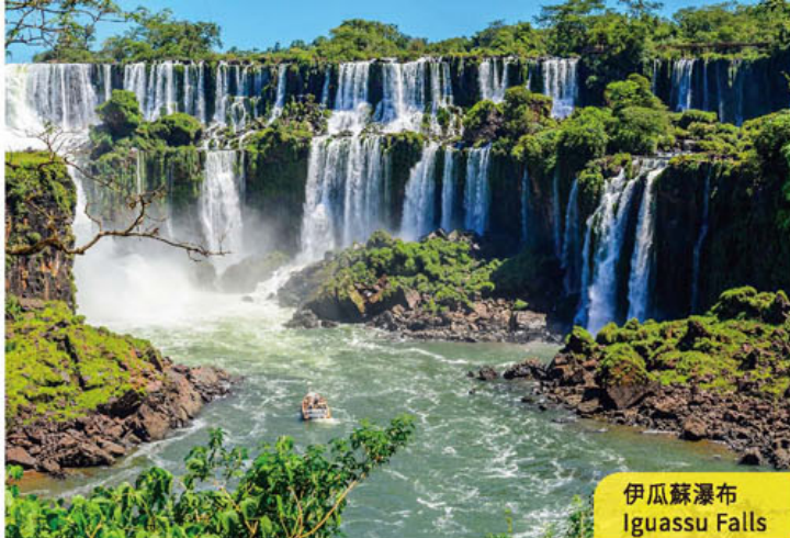
伊瓜蘇瀑布 Iguassu Falls