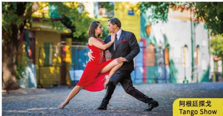
阿根廷探戈 Tango Show

This morning we will begin the day by continuing our Buenos Aires city tour, picking up where yesterday's tour left off to cover all the city's greatest attractions. This afternoon, there will be some free time for your own explorations or for souvenir shopping. Tonight, there is a fantastic opportunity to join an optional tour to attend a tango dinner show here in the city that gave birth to the tango! (B/L)