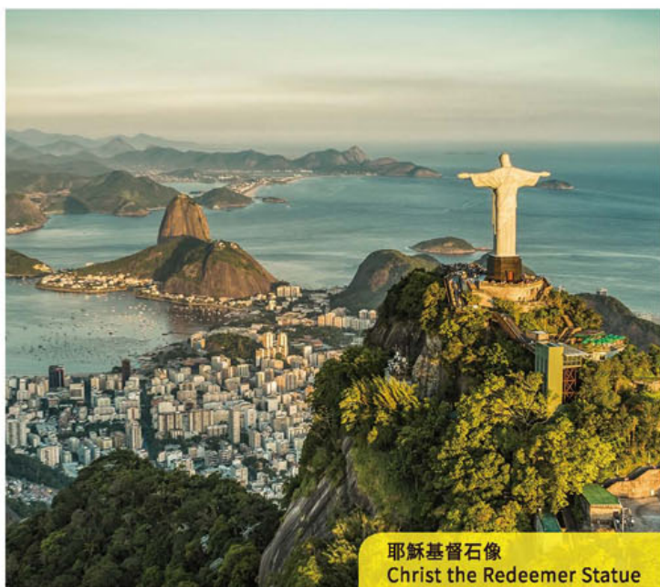
耶穌基督石像 Christ the Redeemer Statue