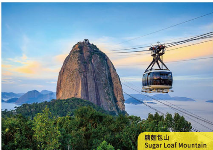
糖麵包山 Sugar Loaf Mountain

Today we will enjoy more of the splendor and beauty of the Iguassu Falls. You have the chance to enjoy the falls from a different perspective, this time from the Brazilian side, with a visit to The Brazilian Falls National Park. Marvel at unique views of the falls, walk the footpaths through lush tropical vegetation and take in the beauty of this natural wonder. Then we head to the airport for the flight to Rio de Janeiro. Upon arrival in Rio, we will head to the hotel for check in. (B/D)