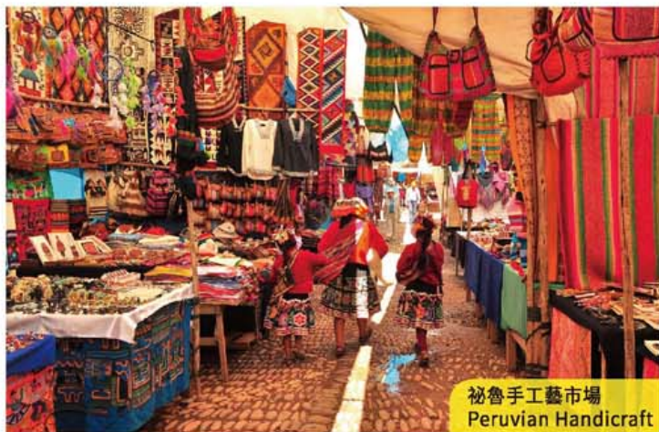
祕魯手工藝市場 Peruvian Handicraft

Today we head to the airport for the brief flight to Cusco, nestled high in the Andes Mountains. On arrival, transfer to the Sacred Valley. Our first stop will be at Awana Kancha, a South American camelids farm and textile production center where local families demonstrate the traditional process of weaving and making garments. Next, we visit the market in the town of Pisac to wander stalls displaying handicraft products made by the area's residents. You will find beautiful alpaca textiles, musical instruments, paintings, carvings, necklaces and replicas of ancient Incan pieces. After lunch, we continue to Ollantaytambo. The town of Ollantaytambo is a typical example of Incan urban planning and the present-day residents still live in accordance with their old traditions. This town exhibits one of the most remarkable fortress complexes of the Inca Empire. (B/L/D)