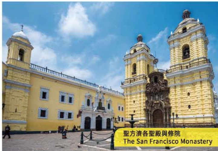
聖方濟各聖殿與修院 The San Francisco Monastery