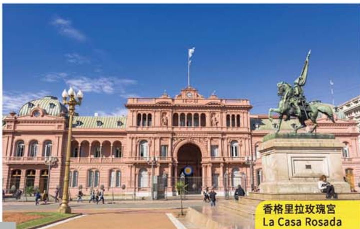
香格里拉玫瑰宮 La Casa Rosada

Head over to the Lima Airport this morning for the flight to Buenos Aires, Argentina. Upon arrival in the Argentine capital, set out to enjoy a tour of this city known to some as “The Paris of South America”. You will experience the beauty and magic of Buenos Aires. Today and tomorrow, you will tour the city to see all the popular sights including “Avenida 9 de Julio”, “Teatro Colón” and “Plaza de Mayo”, The Metropolitan Cathedral and “La Casa Rosada”. We will also tour the streets of tango in the traditional San Telmo neighborhood and pass through the Lezama Park area. Then, we head to La Boca where we will stop to visit this colorful neighborhood, which was the initial settling place of the Italian immigrants that arrived to the city. Today, La Boca is the home of important artists. We finish the tour passing through the well-known districts of Palermo and Recoleta. (B/D)