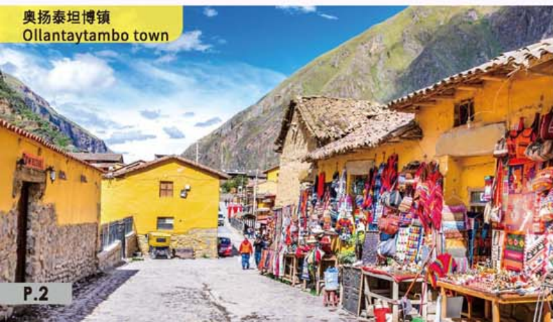
奧揚泰坦博鎮 Ollantaytambo town