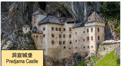
洞窟城堡 Predjama Castle

住宿：Hilton Garden Inn 或同級 (早、晚餐) Morning departure to visit the world-famous Postojna Caves. All will take an electric train into the caves to gaze at their stalagmites and stalactites, as well as their subterranean waters. What a natural wonder! After own lunch, photo stop at the Predjama Castle, the castle build within a cave. The impregnable medieval marvel has been perched in the middle of a 123-metre-high cliff for more than 800 years. Afterward, proceed to Zagreb, Capital of Croatia, a charming medieval city of exceptional beauty. (B/D)