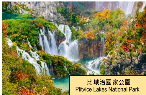
比域治國家公園 Plitvice Lakes National Park

住宿：Hotel Jezero 或同級 (早、午、晚餐) Today full day of sightseeing the paradise-like Plitvice Lakes, a chain of 16 terraced lakes, joined by waterfalls, that extend into a limestone canyon. The mountains, waters and forests are integrated into one. It is as beautiful as a fairyland. The UNESCO has listed it as a "World Heritage Site" for protection. The entire national park is basically divided into two parts: the upper lake and the lower lake. Walk along on the wooden walkways and visit as many upper lakes as you can at your own pace. Then take the shuttle bus to the lower lakes where the big waterfall is. Enjoy the day in Plitvice National Park. Lunch at a local restaurant with grilled lamb. (B/L/D)