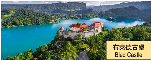
布萊德古堡 Bled Castle

住宿：Hotel Austria Trend 或同級 (早、晚餐) After breakfast, visit Lake Bled. It is a glacial lake in the Alps, the scenery is breathtaking and picturesque. Climb up to the Bled Castle, which has been on the hillside for more than a thousand years. Take a traditional Pletna boat to the island in the middle of the lake. Upon arrival, go up the stairs to the Assumption of the Mary Church and the bell tower next to it (additional fees apply). Lunch on your own. Later drive to Ljubljana, the capital of Slovenia. Upon arrival, stroll through the ancient city. Dinner at a local restaurant, a pork chop dinner with onion soup will be served. (B/D)